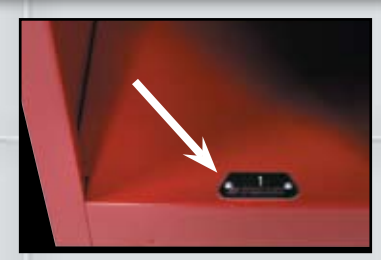
Number plate in bottom of cubbie so children can easily identify their cubbie space.